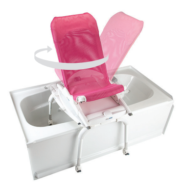
As the upper portion with the bath chair is rotated 90° it moves approximately 12" back over the tub in one motion.