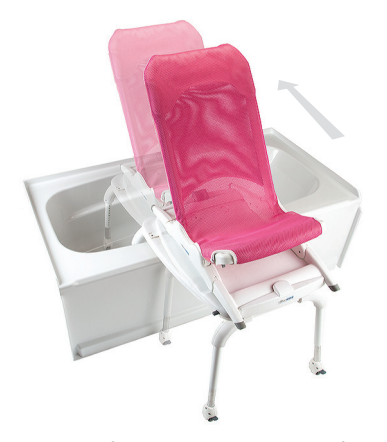
The tub transfer base starts in the position farthest out of the tub. It is then rolled back over the tub, and the brakes are set.