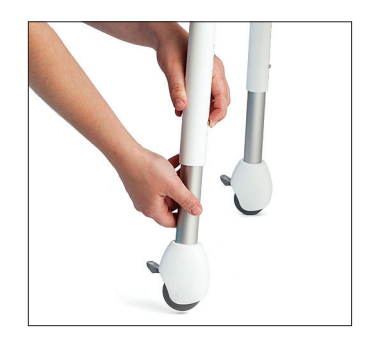
The legs of the tub transfer base can be adjusted in increments of 5%" to fit bathtubs up to 24" high.