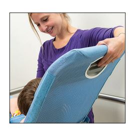
One-hand adjustment Adjust backrest angle with one hand, keeping the other hand on the client for safety and reassurance.