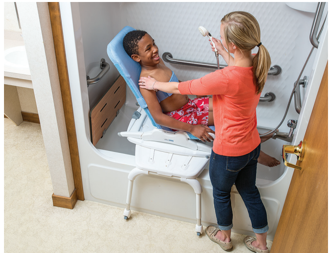
4. In the final position the bath chair is over the tub and can be adjusted as desired for showering.