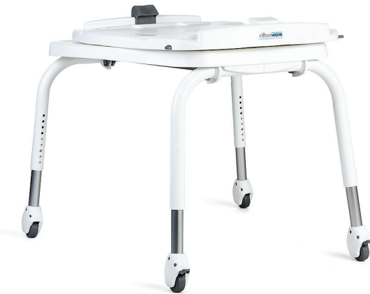
Tub transfer base