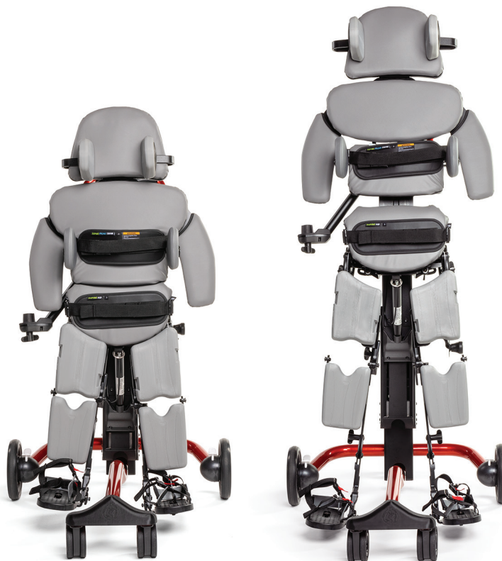
New! Size 3 Stander at its smallest and largest settings