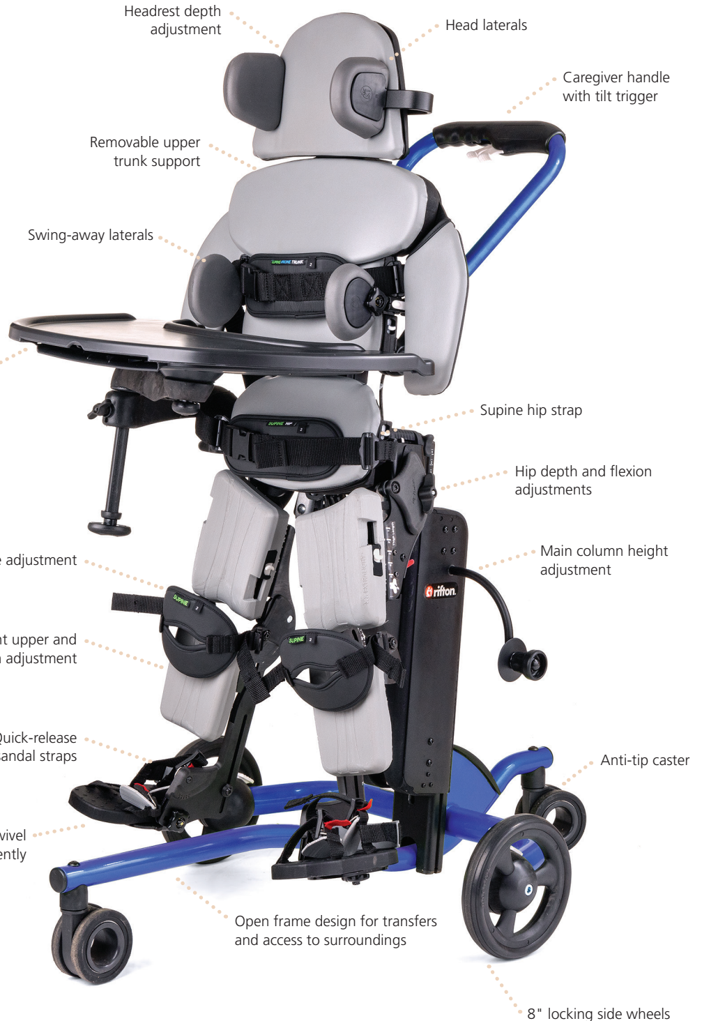
Size 2 Supine Stander