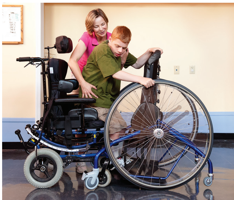
The wide, accessible deck makes transfers easy.