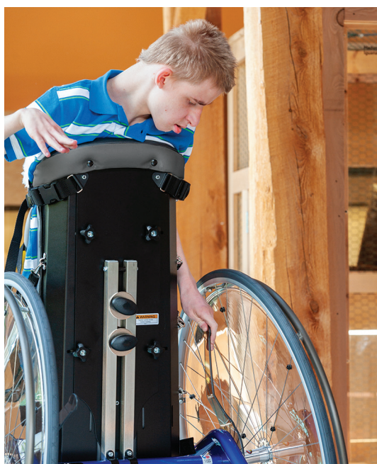
Large brake handles are conveniently located for user operation.