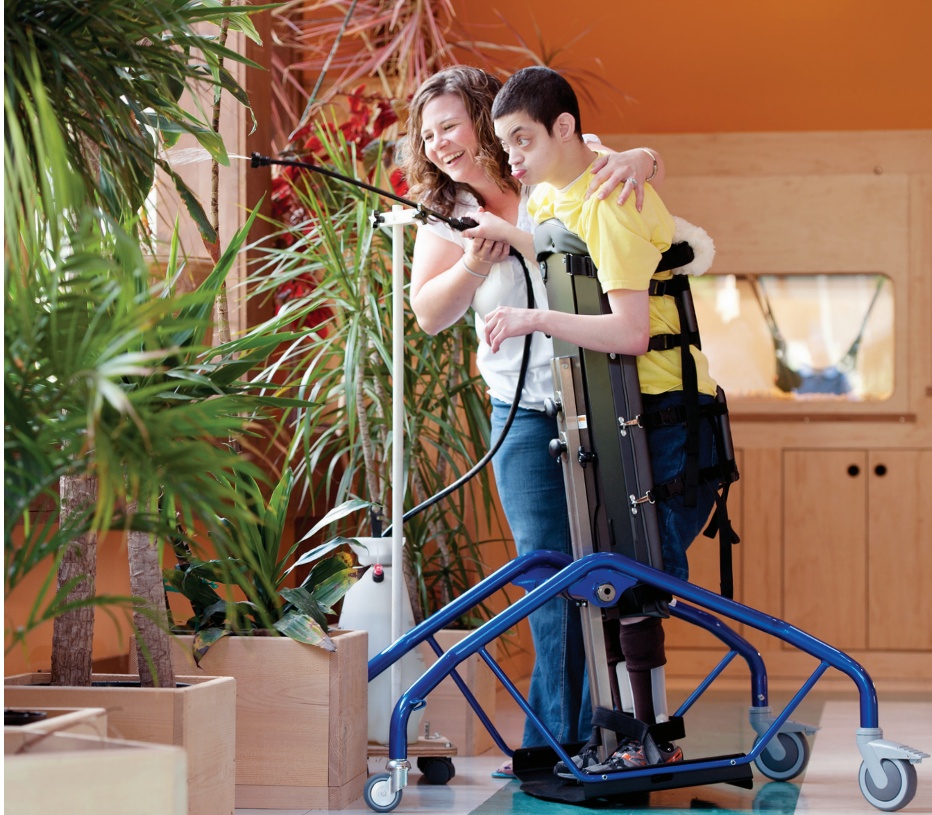
Supported by the Mobile Stander, users can participate in a variety of activities.