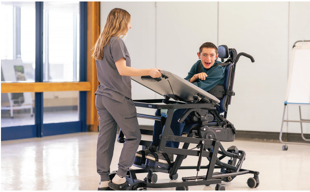
Optional tilt adjustment 0° – 50°