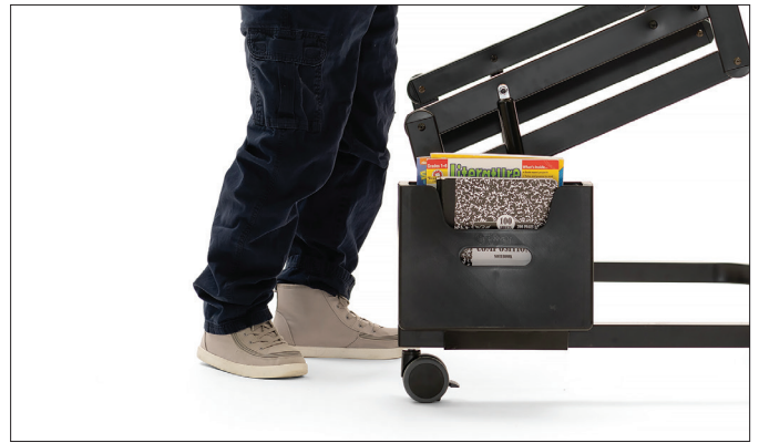
The side storage box offers convenient accessory organization.