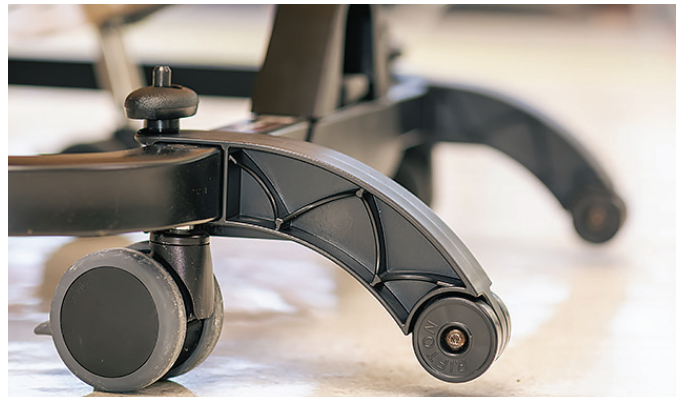
Anti-tip rollers keep the desk from tipping forward.

The Adaptive Desk comes in your choice of surface colors.