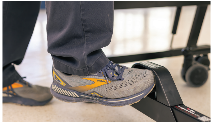
Foot activated continuous height adjustment 23" – 43"