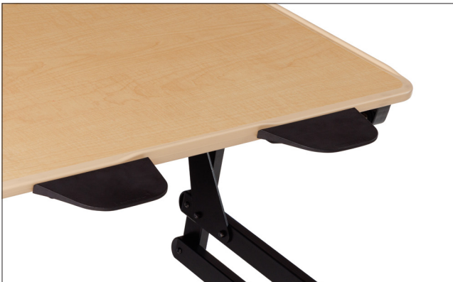
Adjustable elbow supports offer better forearm support than desk cutouts.