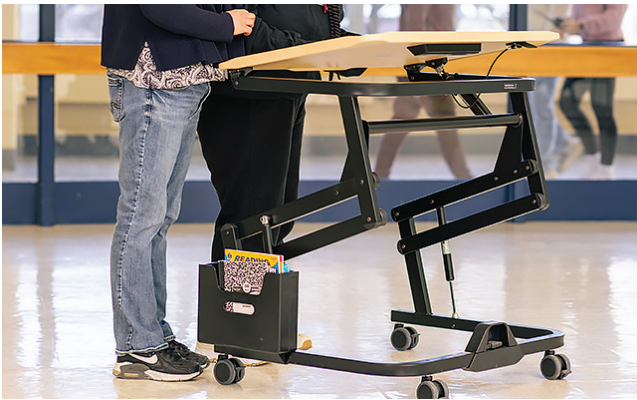
The mobile base adapts to dynamic classroom environments.