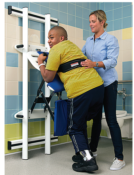
With the kneeboard in use, adjust the trunk board angle to a more upright position to promote increased weight-bearing.