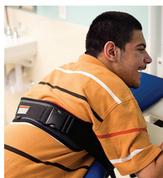
The support strap provides additional security during hygiene care.