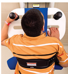
Handholds and slots in the trunk board enable the user to assist in a transfer.